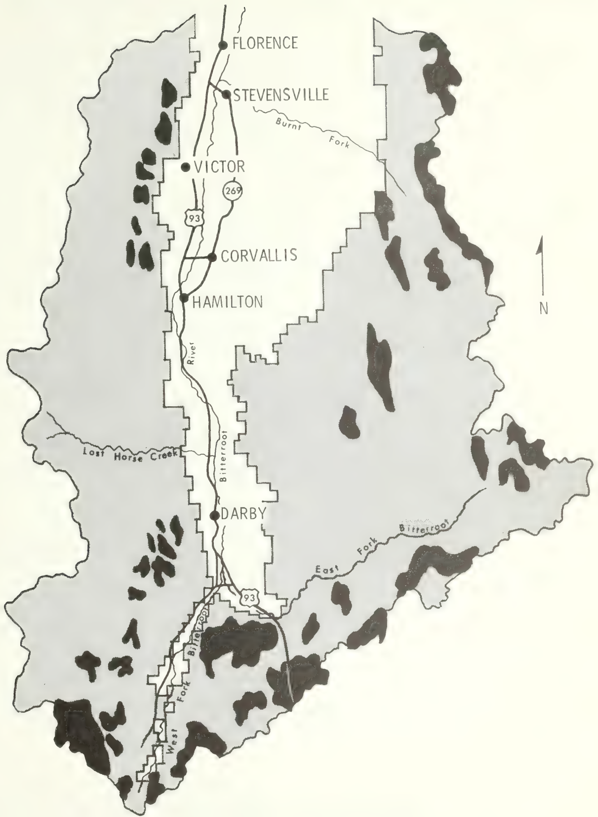
Figure 4.--Principal stands of mature lodgepole pine, Bitterroot National Forest.